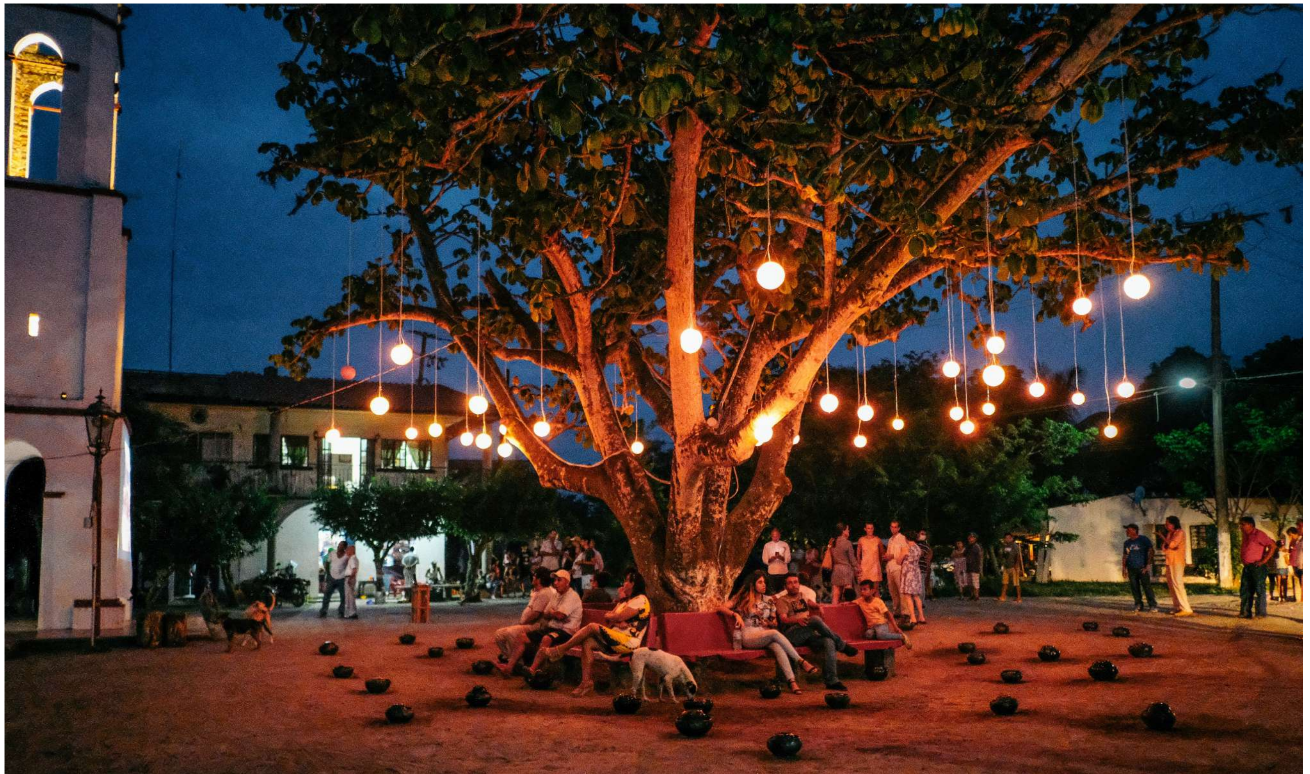
Rains of May | Sound installation, Video (3min) | In collaboration with the inhabitants | Mexico | 2020 From its heights, the tree shares its remembrances with us: from extraordinary fruits, drops fall on metallic drums placed around its trunk. Each drum represents one year in the life of the tree and has an inscription with the memories of the people. Individual stories shape collective history. felixblume.com/lluviasdemayo