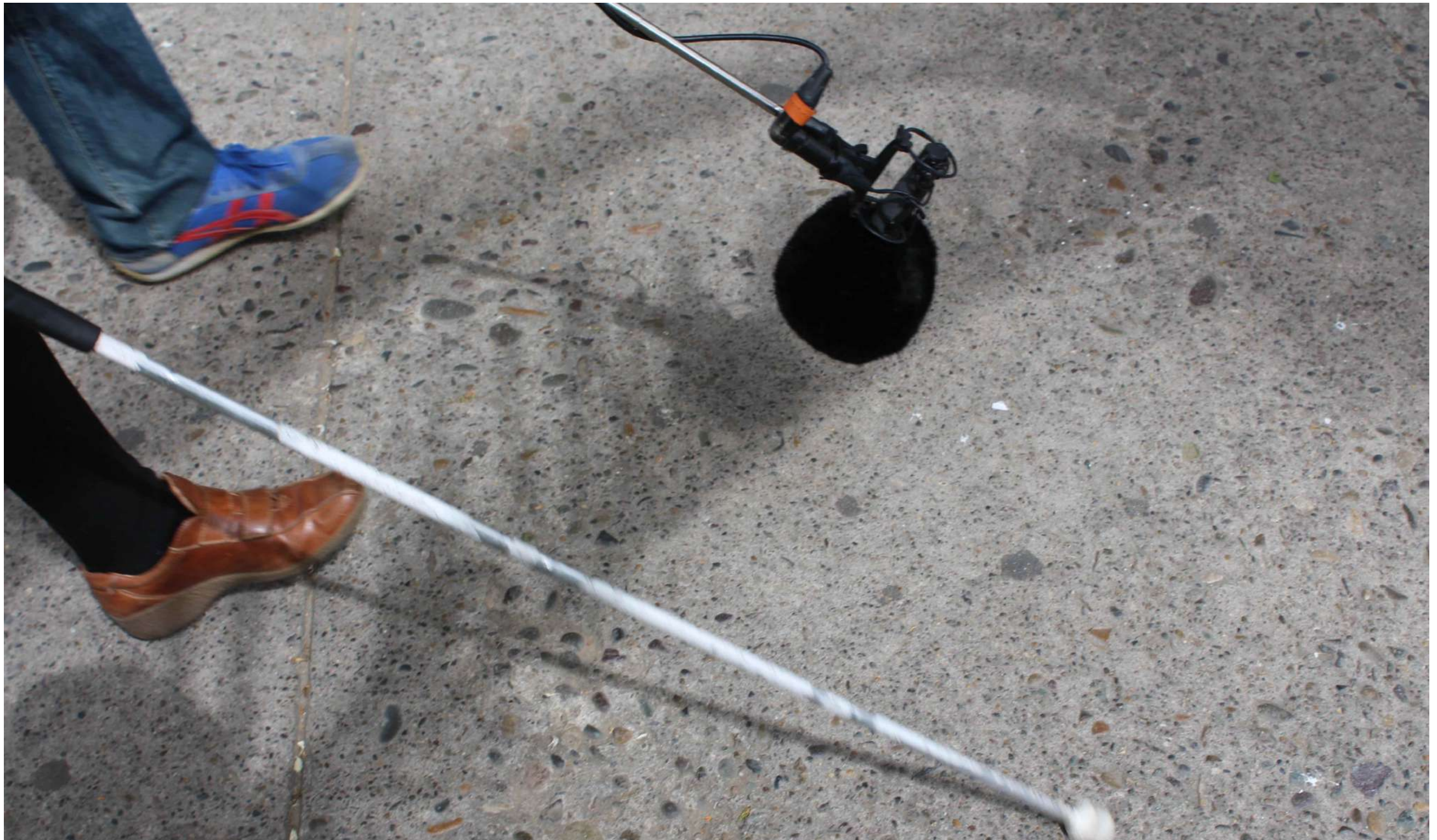
Sonic Traffic Light | Sound installation | In collaboration with blind people | Chile, Mexico | 2015-2016 A group of blind and visually impaired people chose the sounds of the audible pedestrian signals in Mexico City and in Valparaiso (Chile). This was a result of a workshop during which field recording lead to the registration and design of the chosen sounds. felixblume.com/semaforossonoros