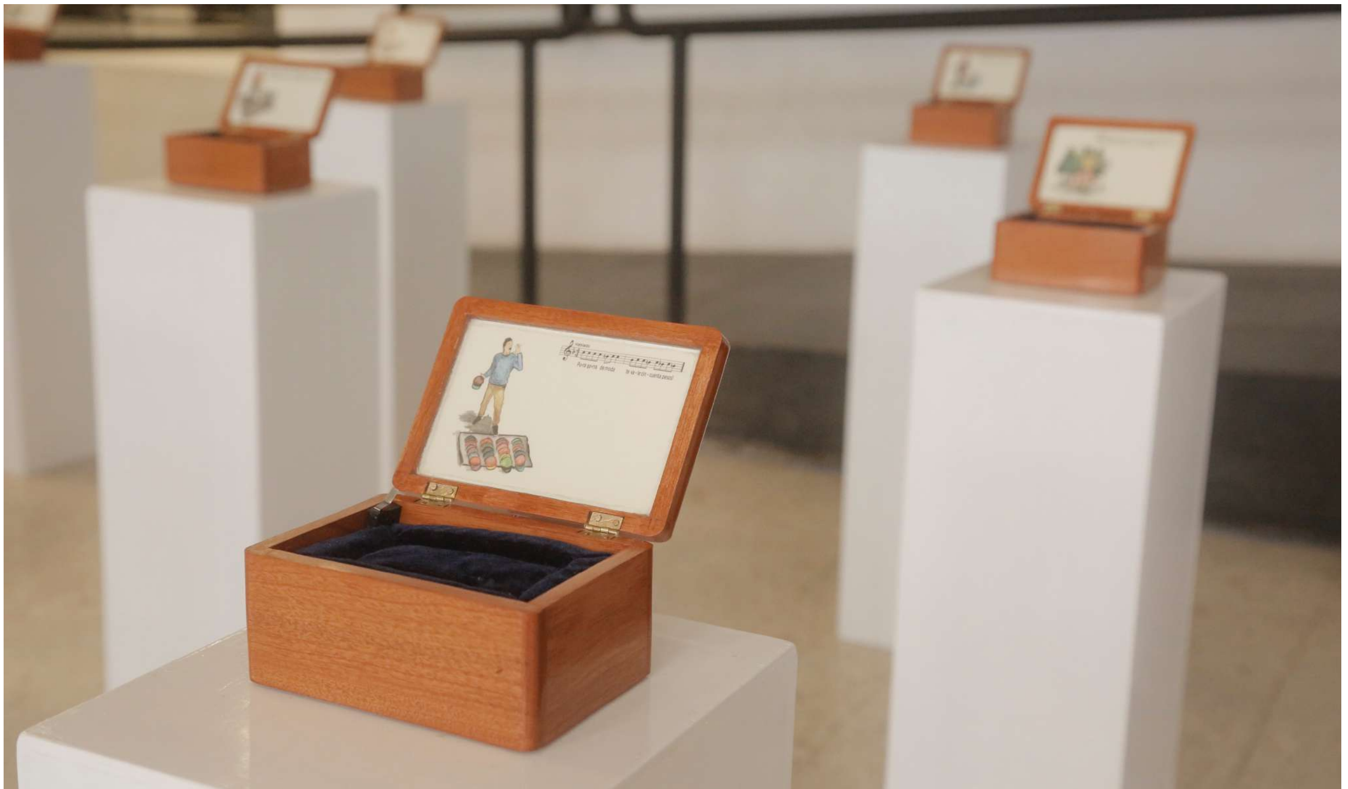
Informal Chorus | Sound installation | In collaboration with Daniel Godínez & street sellers | Mexico | 2016 Interactive sound installation made of 10 wooden boxes, each one containing the screaming and the drawing of a street seller. The visitors are invited to open the boxes to liberate their sounds and watch the illustration, deciding themselves the number of voices that will integrate the informal chorus. felixblume.com/coroinformal